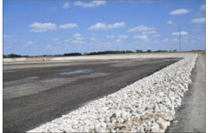
Construction on Newell wastewater project nears completion.